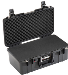
1506WF With Foam