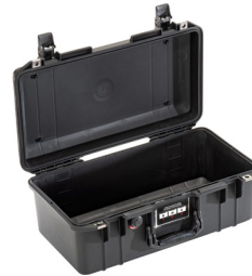
1506NF No Foam