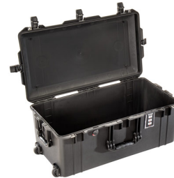
1626NF No Foam