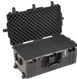
1626WF With Foam