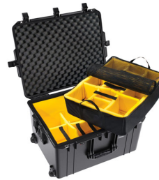
1637WD With Padded Dividers