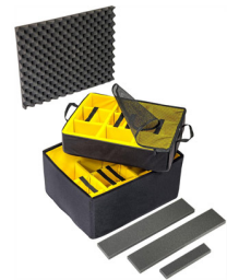
1637AirDS Padded Divider Set

P.O. Box 936 Sykesville, MD 21784 www.SpecialtyCases.com