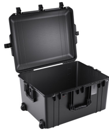
1637NF No Foam