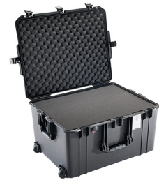
1637WF With Foam