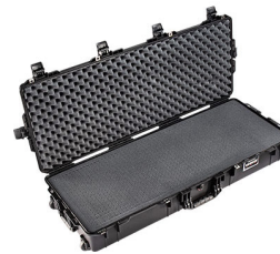
1745WF With Foam