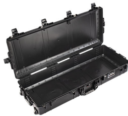
1745NF No Foam