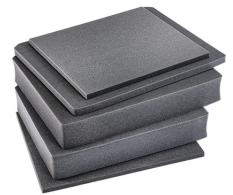
V600FS 4 pc. Replacement Foam Set